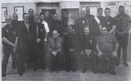
Knights of Columbus (Father Heslin Council 2557) Turlock members.

Father Heslin Council is a Catholic fraternal organization that has been serving the Sacred Heart Parish, Sacred Heart School and the community for over 100 years. The basic principles of the order are charity, unity and fraternity. The Knights participate and host programs that put faith in action, from Coats for Kids, sup-